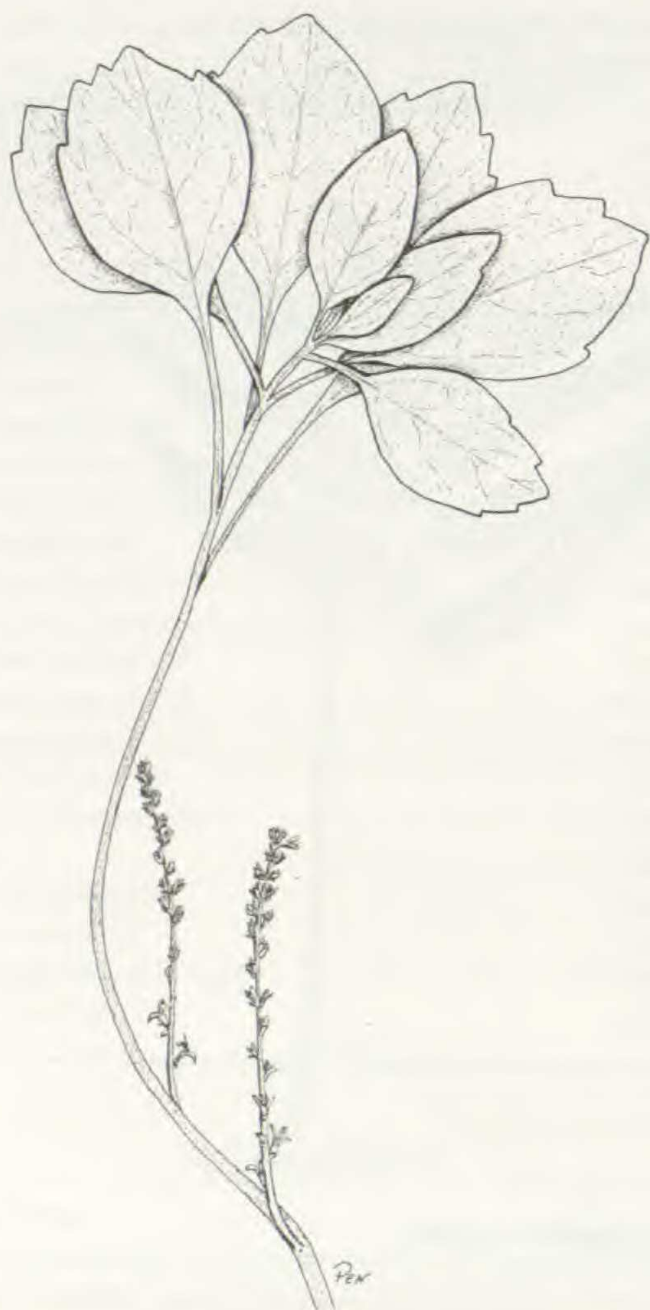
FIG. 6. Pachysandra procumbens .